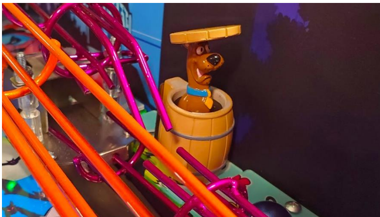
Scooby Barrel Sculpt