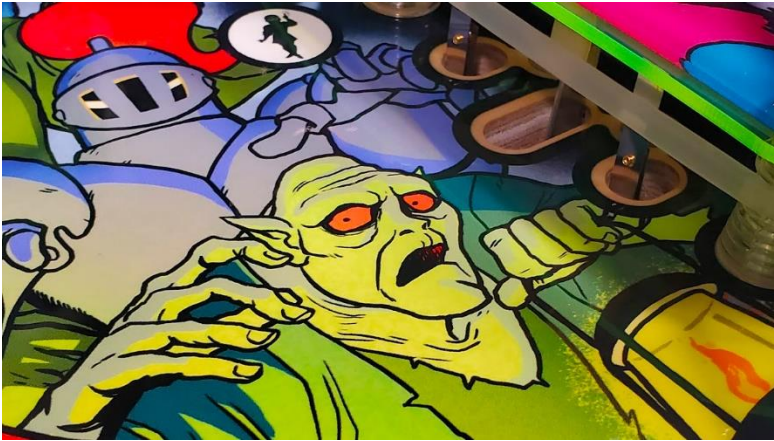
Zombie & Black Knight