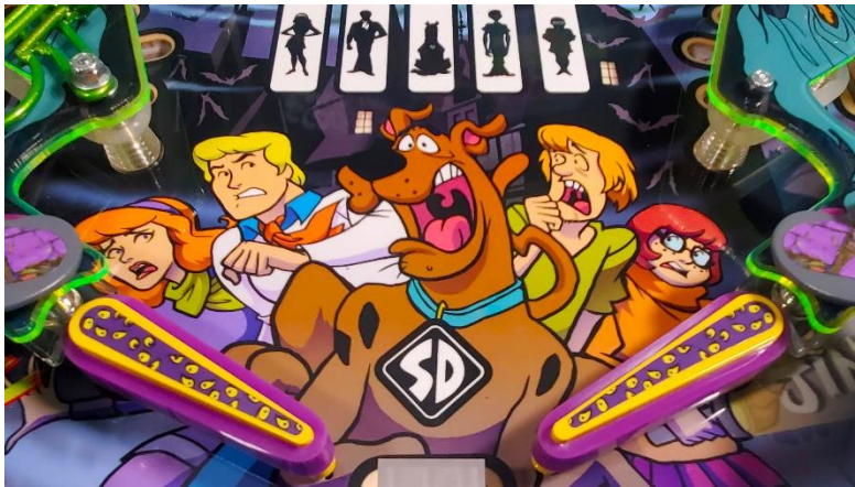
Mystery Inc & Balls Save Drop Target