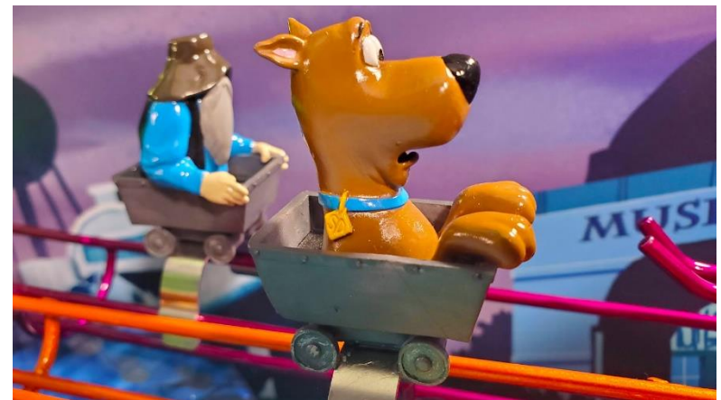
Scooby & Miner 49er Sculpt