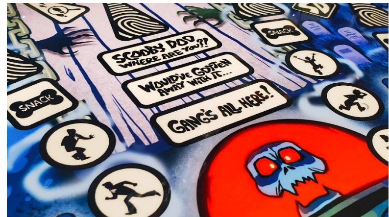
Wizard Mode Inserts