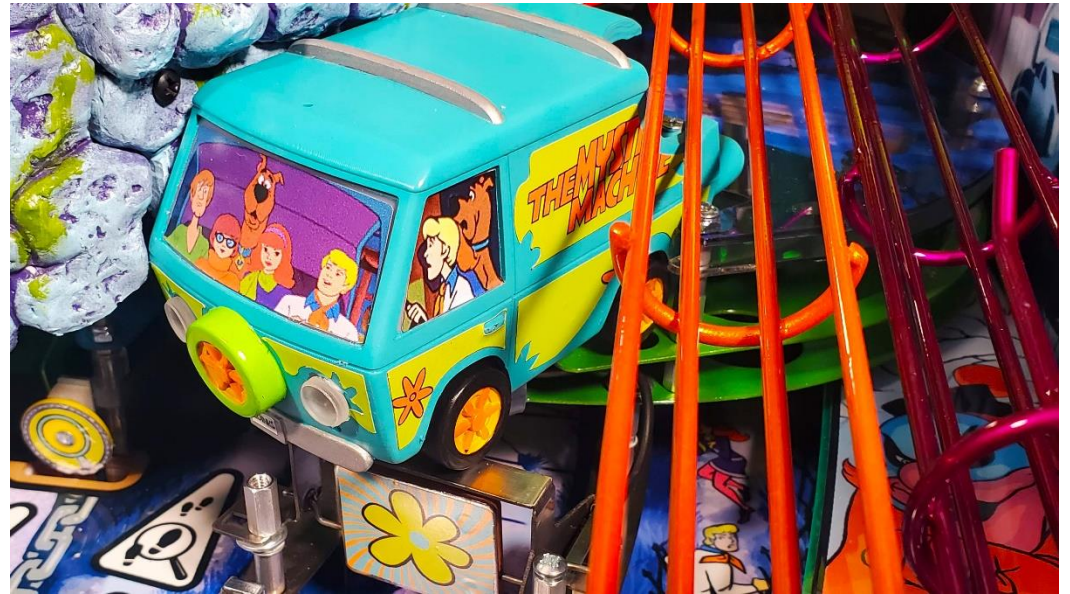
Mystery Machine Sculpt