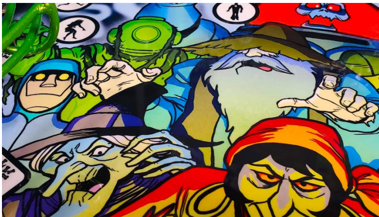
Charlie, Cutler, Witch, Miner, Space Kook, Fortune Teller