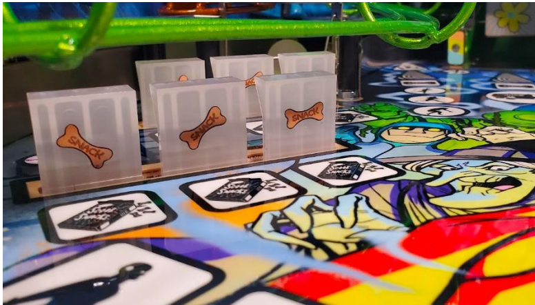
Scooby Snack Target Bank